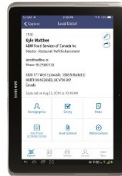
Tablet Badge Scanner

Early bird discount is available through January 14 th .