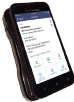
Handheld Badge Scanner